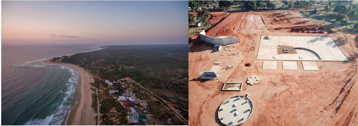
Above image on the left is of Jangamo Bay from the Mission Blue website, Above image on the right is from ADP Mozambique's website showing construction for Mutamba Mineral Sands in Rio Tinto.