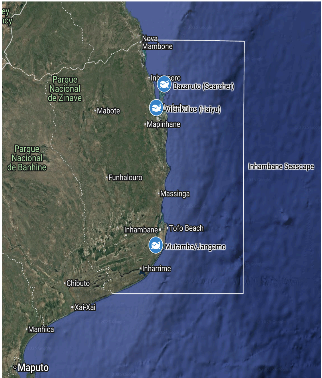
Mutamba Mineral Sands Project falls within the Inhambane Seascapes